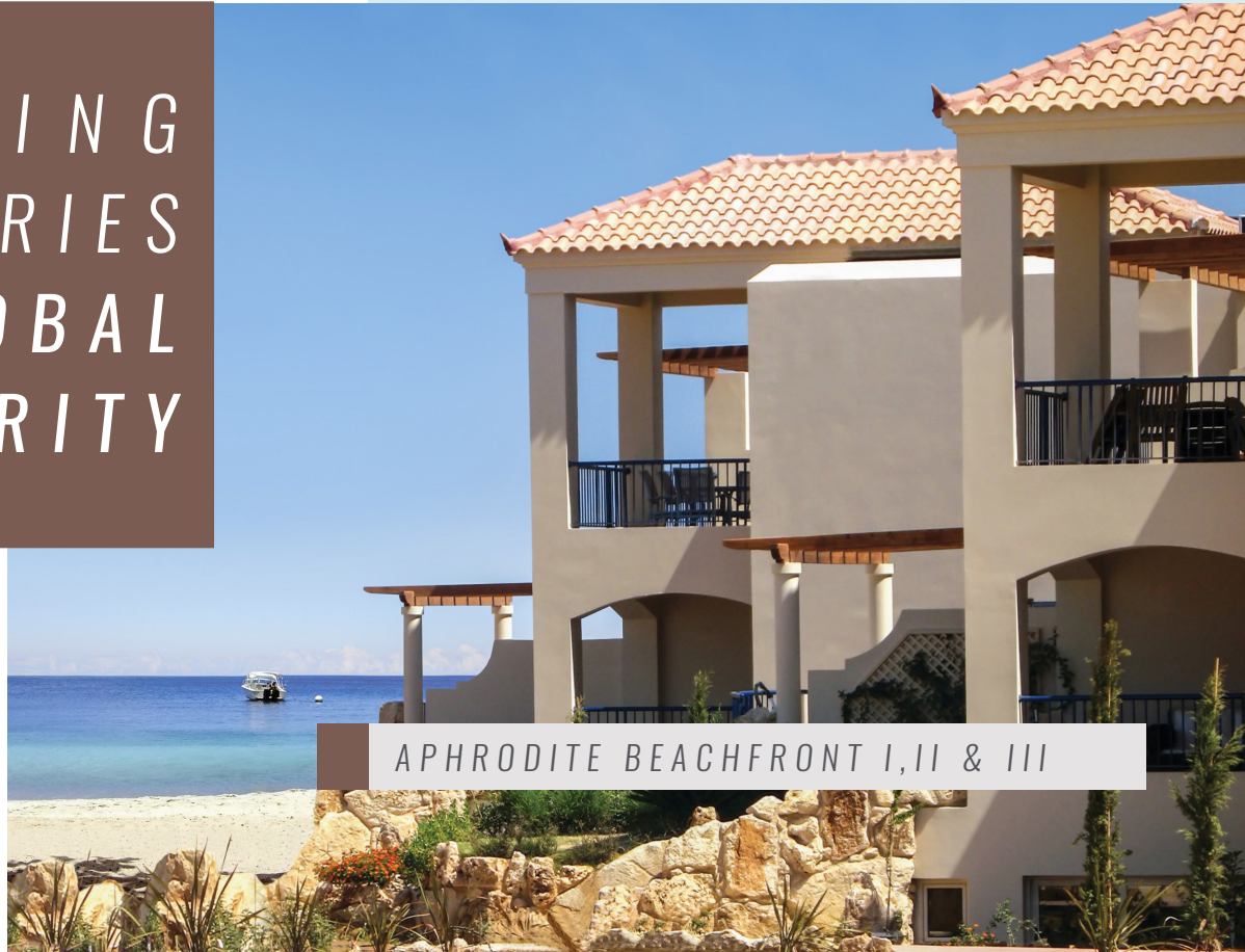
APHRODITE BEACHFRONT I, II & III