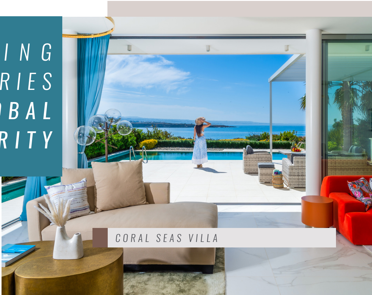
CORAL SEAS VILLA